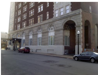
EverLast® 70w Induction Acorn Fixtures

The city of Utica was founded in 1832 and is located in a region known as the Mohawk Valley in Central New York. Its residents take pride in the city’s historical properties and background. The historic structures that still populate the city are not only symbols of the City’s proud past, they continue to contribute to its vitality today – as homes, businesses, meeting places, cultural centers and more. 1